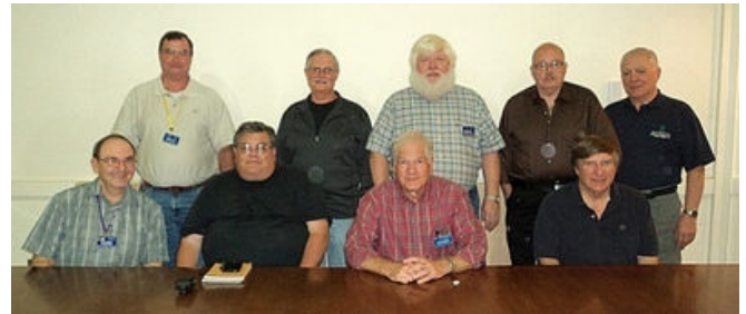
MARC Board for 2013-2014