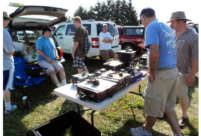
Buyers and Sellers in the Flea Market