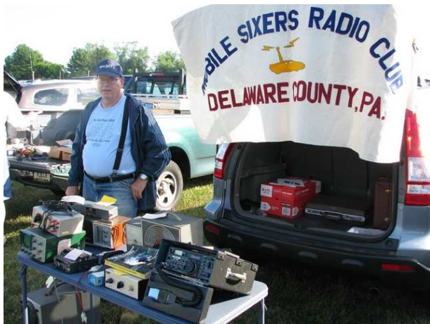
Mobile Sixers Table in the Flea Market

The hamfest was held at the Kimberton Fairgrounds near Phoenixville, PA. Many years ago, MARC would rent the fairgrounds at a cost of $900 to the club. In recent years, the Kimberton Volunteer Fire Company (owners of the fairgrounds) offered the use of the fairgrounds to us for our