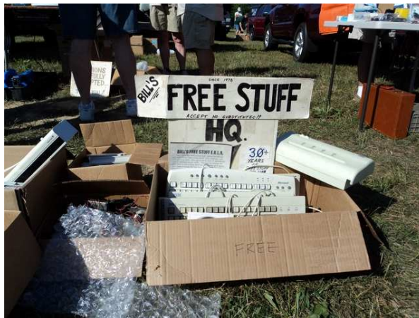
Stuff We All Can Afford