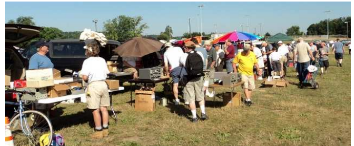
Great Crowd in the Flea Market on a Beautiful Day

The date for the 2012 MARC Hamfest and Computer Fair will be Sunday, July 8, 2012.