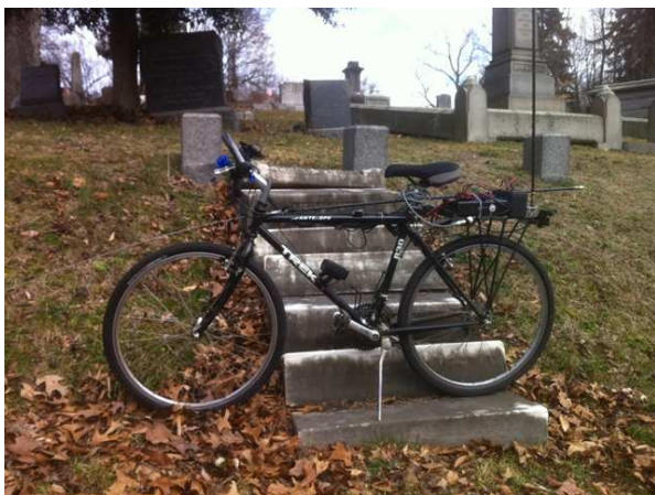
Figure 24 - Bicycle mobile station at a favorite operating spot, St. Agnes Cemetery in West Chester, one of the highest points in Chester County. It's an easy ride to and from my home and it's downhill all the way home!