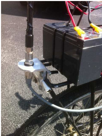
Figure 24 - Antenna mount and battery. The transceiver body is between the battery and the back of the seat.