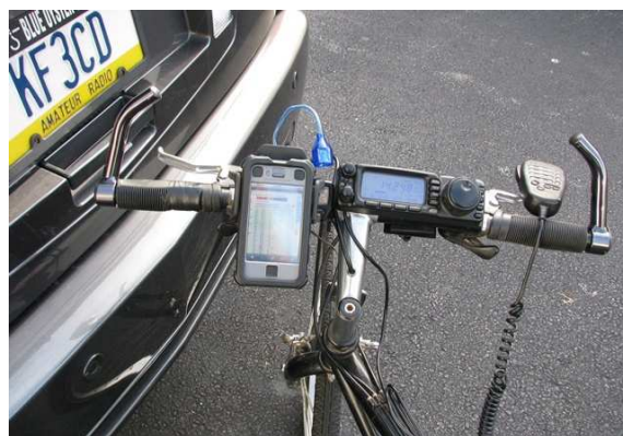
Figure 15 - Yaesu FT-100 control head remotely mounted on handlebars, with iPhone monitoring DXwatch.com and LED light for night-time logging.

At the time of this writing (early Feb.), I have 91 DXCC entities and 36 states worked from my bike, all with 50 watts or less (I usually operate at 35 watts). Hopefully by the time this is published, I will have surpassed my initial goal of working 100 countries for a Bicycle Mobile DXCC. ( EDITOR'S NOTE: As of March 13, 2012 Mike has 102 countries so he has reached his initial goal. Congrats, Mike! ) I operate on and have ham sticks for 10, 17 and 20 meters and my farthest contacts so far from the bike are Australia, Falkland Islands and Russia. A few of the somewhat rarer DX contacts I have made from my bike include Market Reef, Malpelo, Oman, Svalbard Island, Isle of Man, Orkney Islands, Luxembourg, Saudi Arabia, South Africa and Guantanamo Bay. I have worked most of the common countries in Europe and South and Central America. Every contact I make is surprised and amazed to find out that I am operating from a bike and nearly everyone tells me that they have never worked a bicycle mobile station before. That really makes it fun!