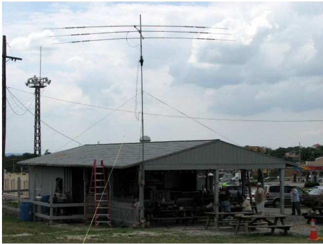
Tribander and Pavilion

The food situation was a bit different from previous years in that we had some chips and pretzels on hand and went out and got some hoagies from Turkey Hill and a few pizzas from a decent pizza place right across the street from the firehouse. Bob Palin N3JIZ and Dieter K3DK brought 3 large coolers so there was plenty of ice cold drinks and cold water. Since there wasn't such a BIG focus on food/eating, it was less of a distraction and more people were digging in and operating.