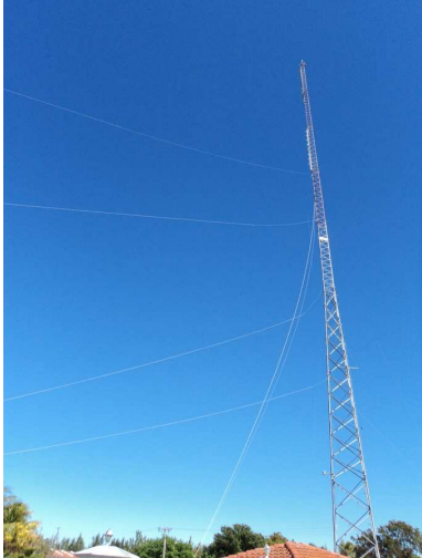
Antennas strung from unused 160-foot commercial tower

80 feet, the 20m antenna at 70 feet and the 10m antenna at 60 feet. The saltwater nearby also helps a lot.