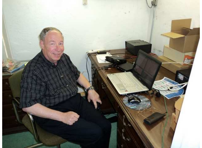
Al N3EA operating as C6AEA from the Bahamas

This trip was only four days long; same as back in 2012. The weather was cool for the Bahamas with high temperatures in the upper 60s. The Islands of the Bahamas are gorgeous and the people are very friendly. I highly recommend going there whether for hamming or not. Our home was within a few minutes' walk from Taino Beach.