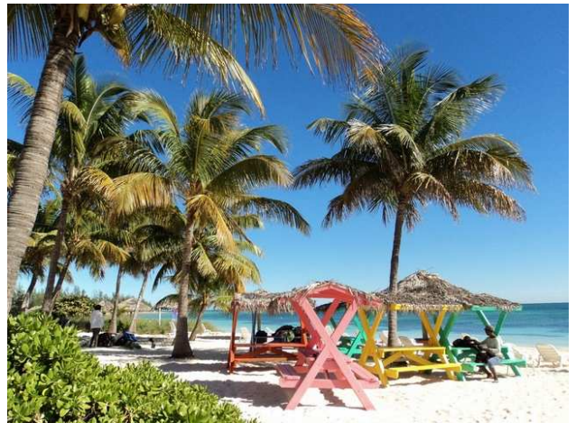
Taino Beach Resort

This trip was only four days long; same as back in 2012. The weather was cool for the Bahamas with high temperatures in the upper 60s. The Islands of the Bahamas are gorgeous and the people are very friendly. I highly recommend going there whether for hamming or not. Our home was within a few minutes' walk from Taino Beach.